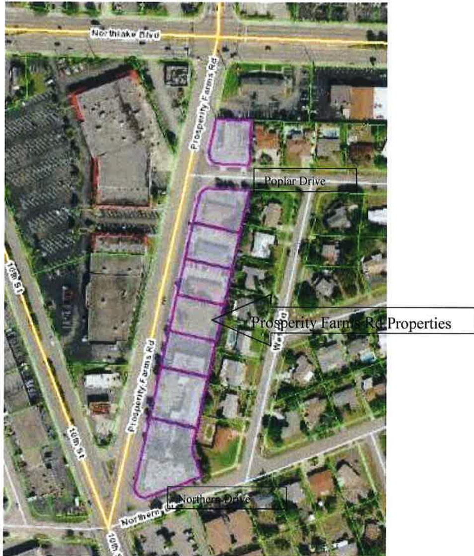
FIGURE 1 Subject Parcels