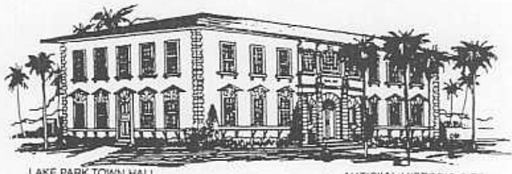
LAKE PARK TOWN HALL NATIONAL HISTORIC SITE