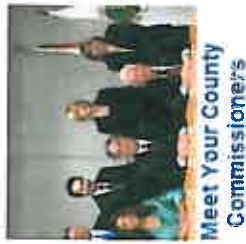
Meet Your County Commissioners's