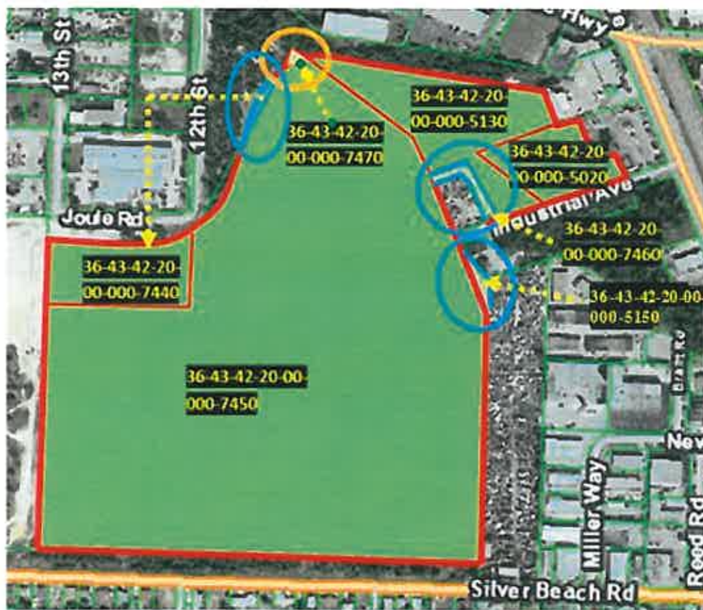
Exhibit "B" Location Map

(The map shown above represents the proposed Scrub Area Boundary Map with indications of which parcels need to be added and removed. Areas to be removed are circled in orange; areas to be added are circled in blue.)