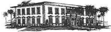
LAKE PARK TOWN HALL NATIONAL HISTORICAL SITE