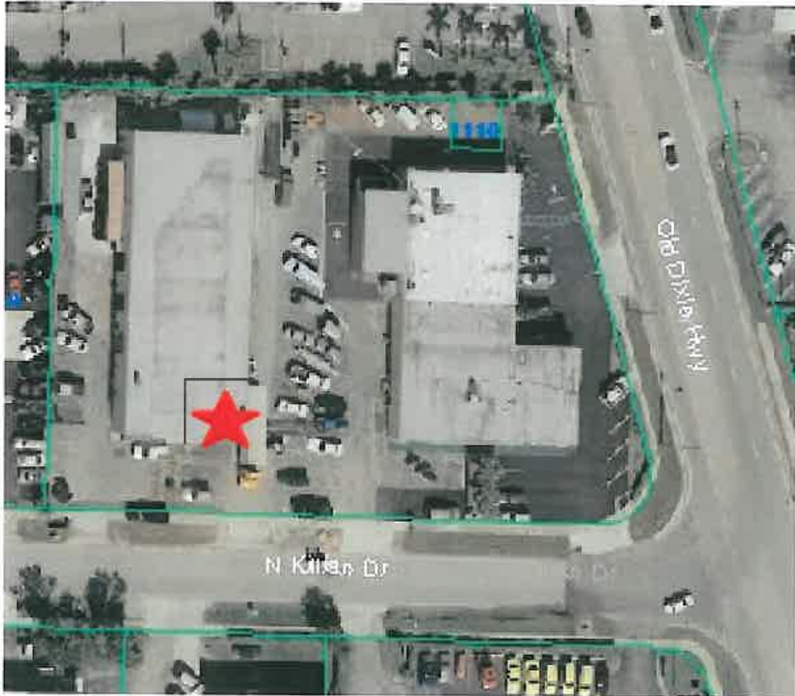
Exhibit "B" LOCATION MAP