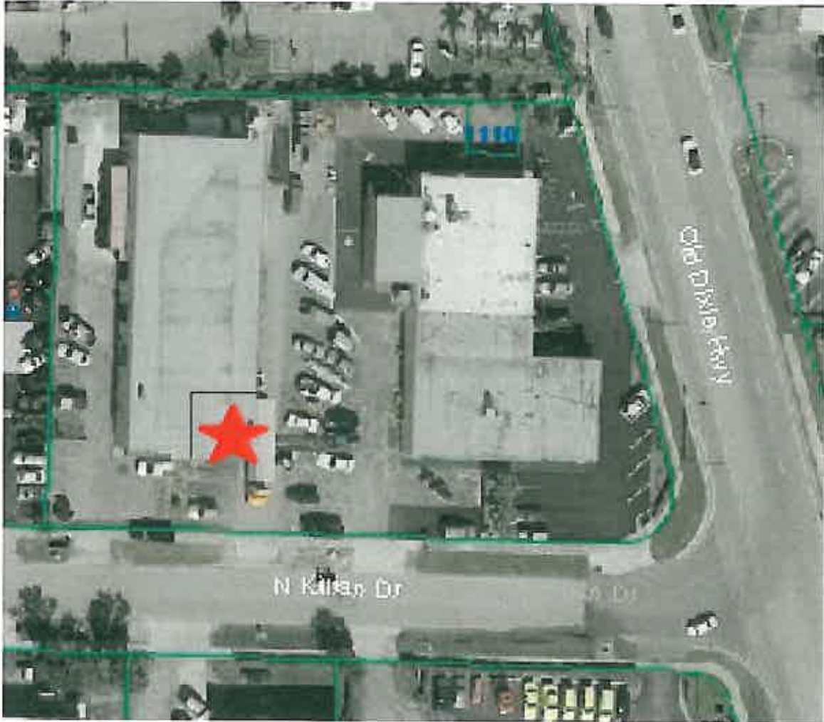
Exhibit "B" LOCATION MAP