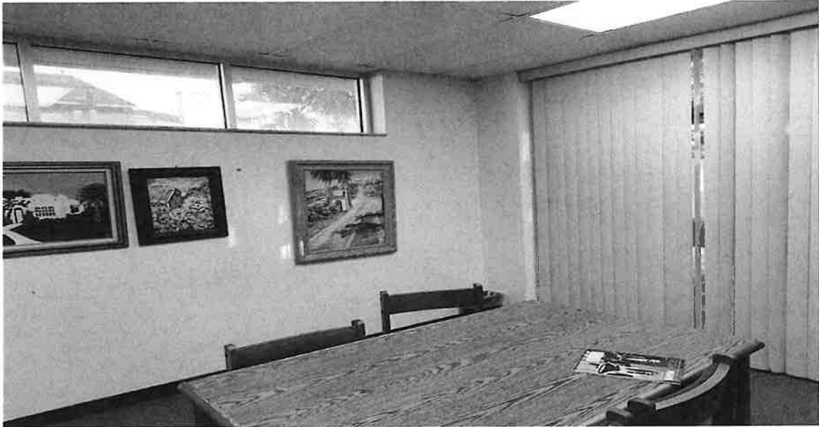
EXHIBIT "B" PREMISES