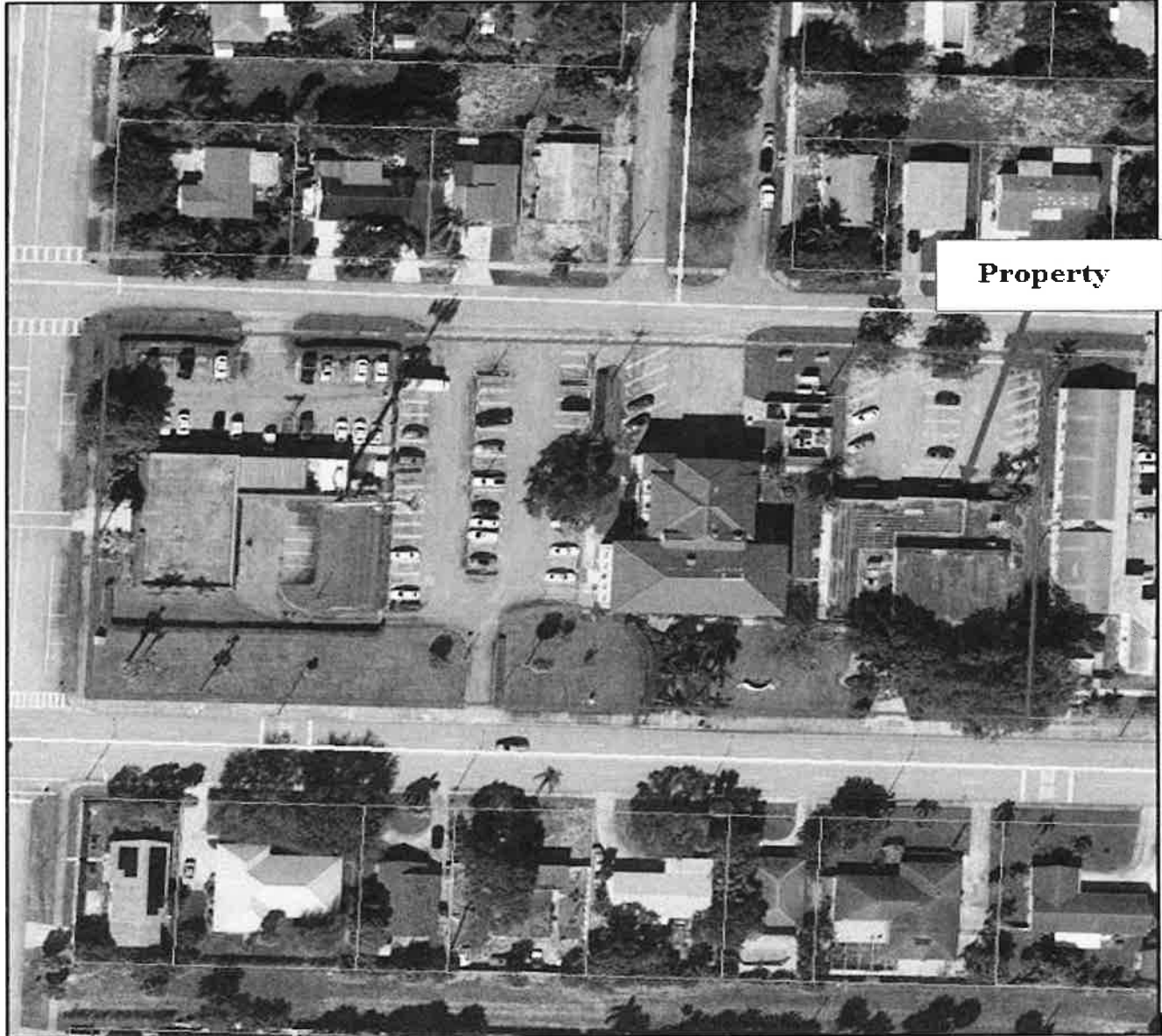
Town of Lake Park Library, 529 Park Avenue Lake Park, FL