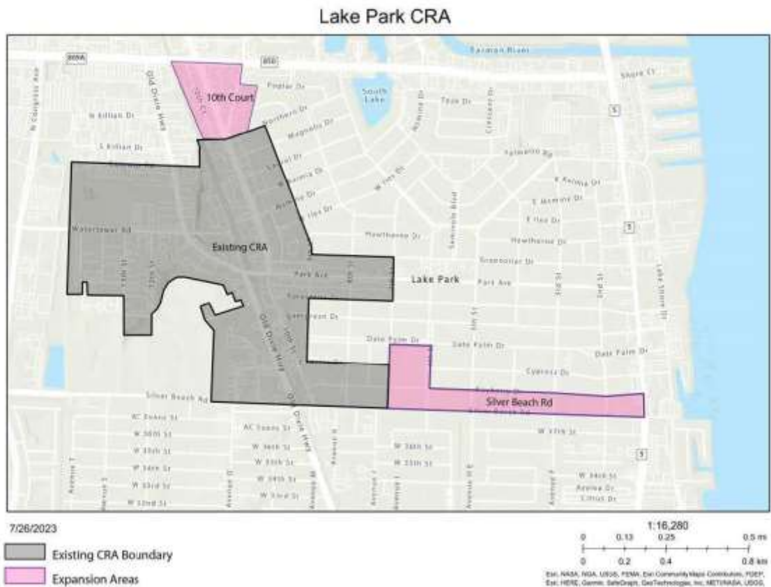
Map of Existing Lake Park CRA and Proposed Expansion Areas

The map illustrates the existing Lake Park C.R.A. and the proposed expansion areas.