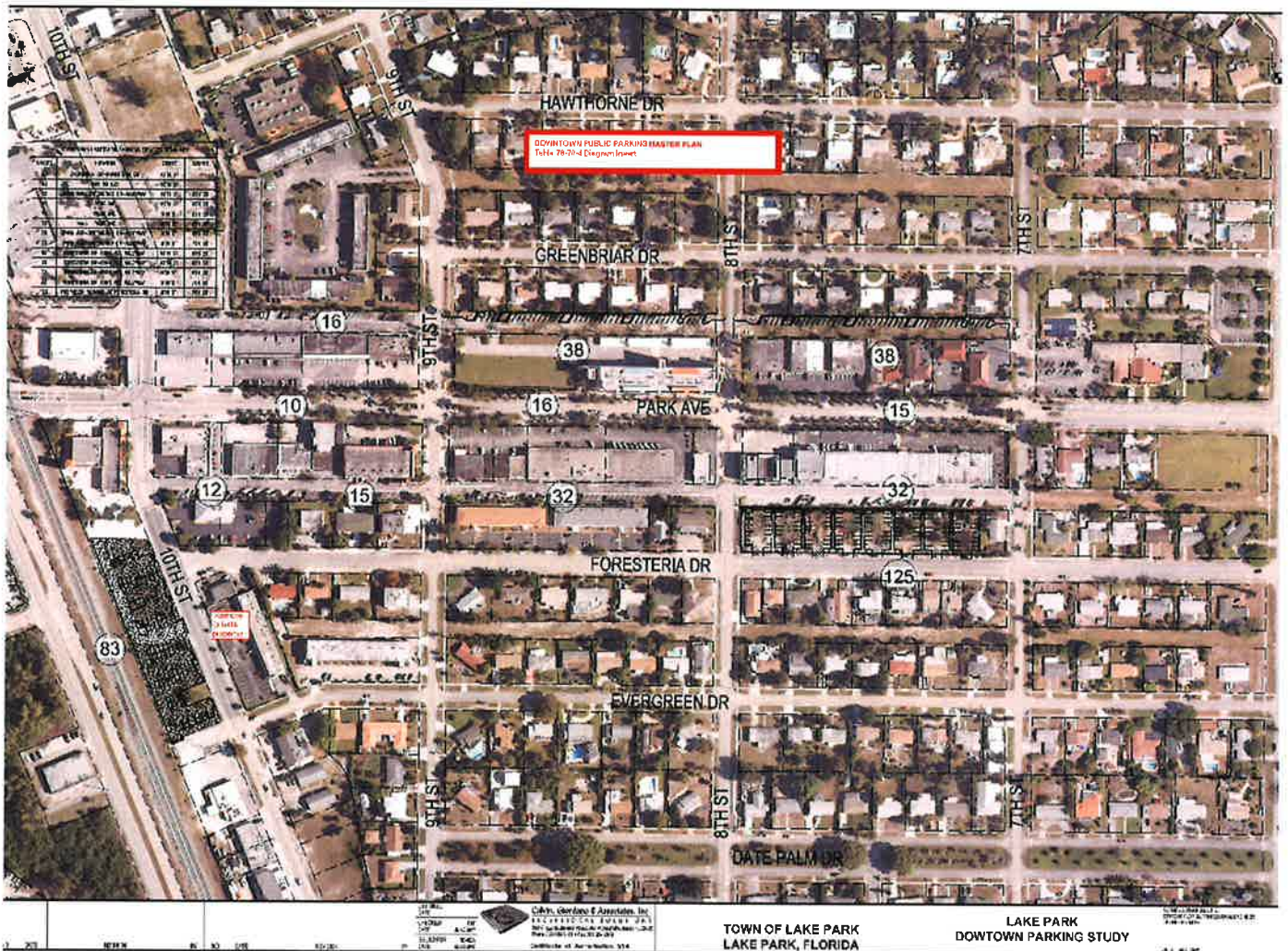
FIGURE 2: DOWNTOWN PUBLIC PARKING MASTER PLAN

A reduction of the parking requirements may be sought, provided the property owner or developer provides additional onsite sheltered bike racks and car share/carpooling spaces as part of a Traffic Management Plan (TMP) which demonstrates that there will be adequate parking, A TMP is required if a property owner or developer proposes parking which is less than that which is required by the town code. The TMP shall identify the strategies for reducing single-occupancy vehicle trips and demonstrate the effectiveness of these strategies based upon professionally accepted data and analysis.