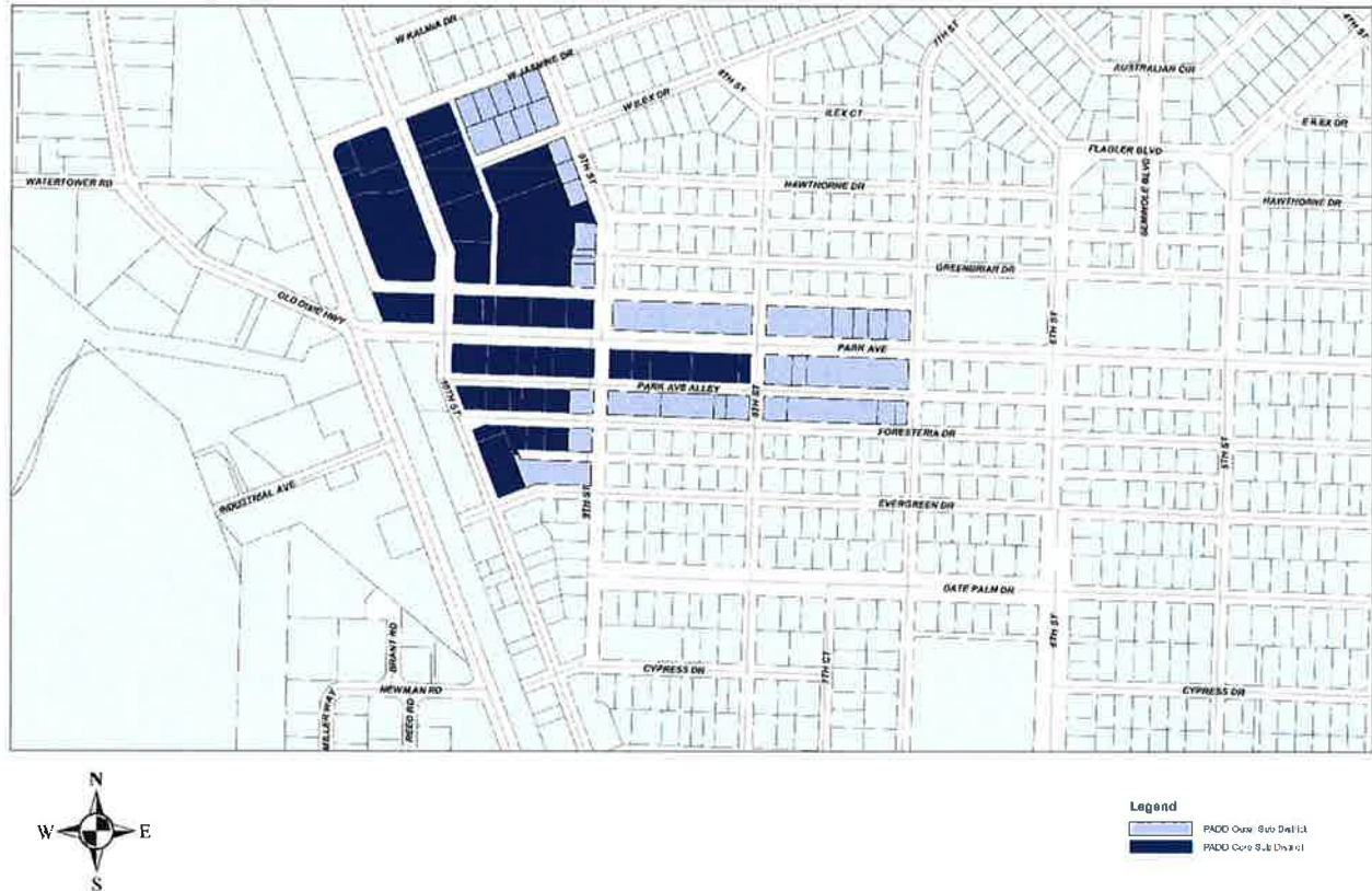
Figure 1 PADD Sub-District Regulating Plan

As illustrated in Figure 1, the PADD is divided into two sub-districts: the Core Sub-District and the Outer Sub-District.